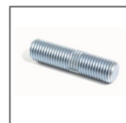
Pictured - KG000059